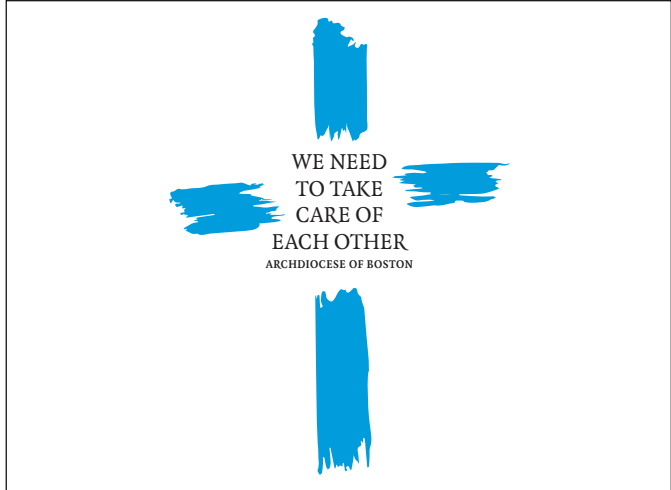
BACK H-Stake Included