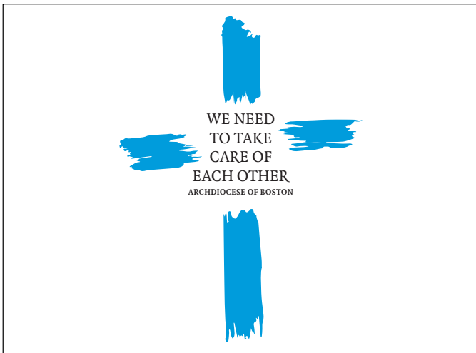
BACK H-Stake Included